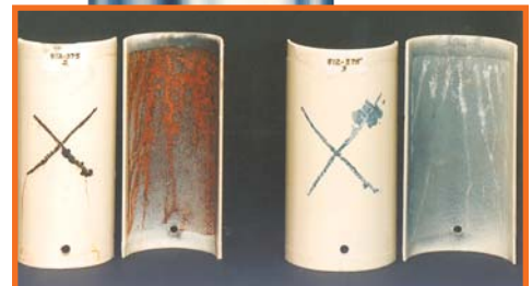
Lower Quality Tubing